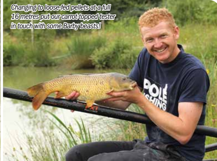
Changing to loose-fed pellets at a full 16 metres put our carrot-topped tester in touch with some Barby beasts!

A very strong, all-round piece of kit from Frenzee – well done guys! m