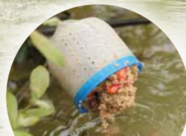
The pole was super-stiff and responsive at 13 metres, making it perfect for snake lakes – it's not just a bagging tool!

appealing. A total of six power kits are provided, plus a cupping kit – all pre-bushed and fitted with the Eeze Glyde System. It was so simple and easy elasticating the pole, and when playing fish during testing I could help but notice how brilliantly the elastic performed – I can't stand top kits that elastic sticks in.