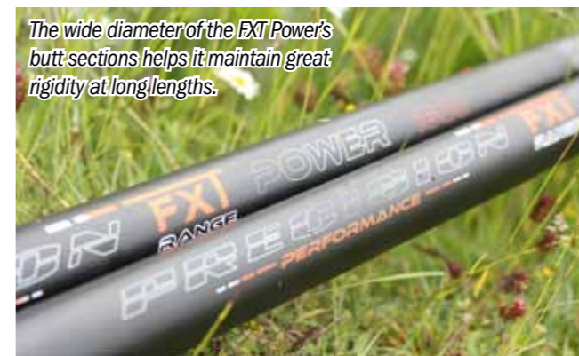
The wide diameter of the FXT Power's butt sections helps it maintain great rigidity at long lengths.

with a pole-mounted pot, and using corn dyed with Sonubaits' pink Bloodworm Lava on the hook, it took just seconds before I was into fish. The first well and truly made me look like a weakling, however. Before I could blink, my elastic was dragged into the tree to my right and a huge bow wave powered out of the other side, smashing my rig to pieces as a Barby Banks beast powered for freedom.